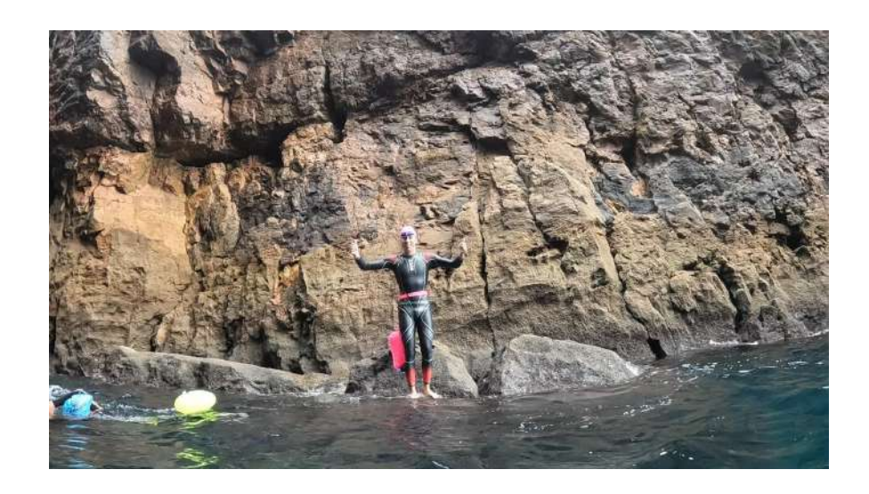
Swim in Sagres also Click for Sagres Vídeo